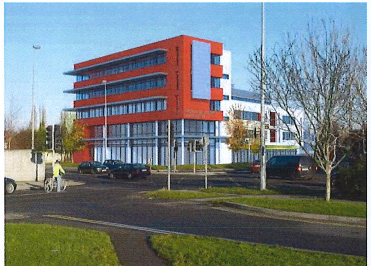
Photomontage of Fonthill Road elevation

It has also been agreed that best practicable means shall be employed to minimise air blown dust emissions from the site. This shall include covering skips and slack-heaps, netting of scaffolding, washing down of pavements and any other precautions necessary.