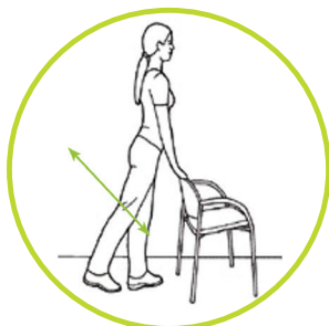
Kick straight back