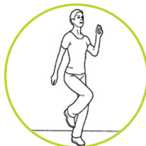
March on the spot