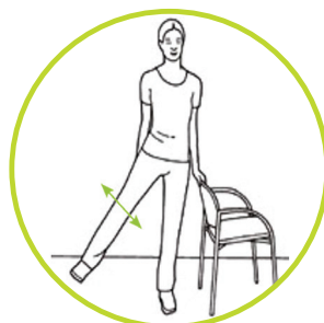
Leg out to the side