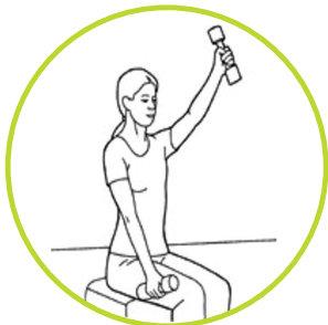
Arm straight up