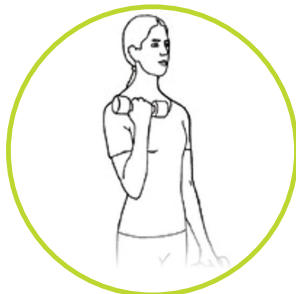
Bend and straighten