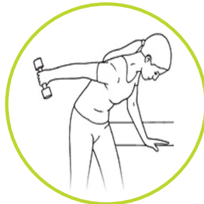
Straighten at elbow