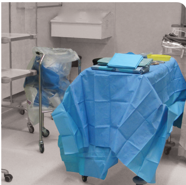
A mobile recycling bin in use near an equipment preparation area.

Mobile bins are also beneficial if space is limited in connecting rooms (e.g. theatres, out-patients clinics and preparation rooms), and it is not possible to provide a recycling bin in each room. The mobile bin can be moved between the rooms, as needed. This also reduces the investment required for the purchase of bins.