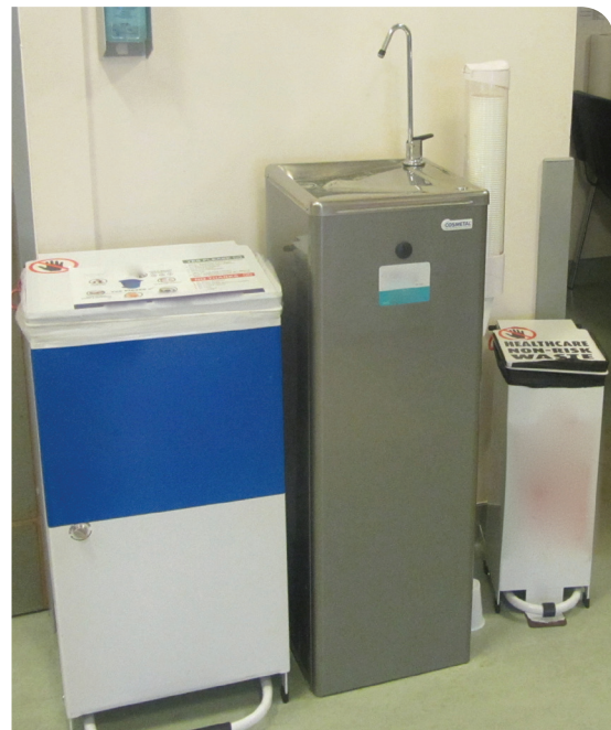
Example of the correct provision of bins in the corridor of a ward. A large quantity of recyclables and a small quantity of general landfill waste are produced in the area. The corridor is thus provided with a large recycling and small general landfill waste bin.

For example, in one facility, the anaesthetist produces small quantities of clinical waste, but is not provided with a clinical waste bin. The waste is removed by nursing staff and placed in another bin. This reduces the work associated with emptying and replacing the bag in a barely filled bin.