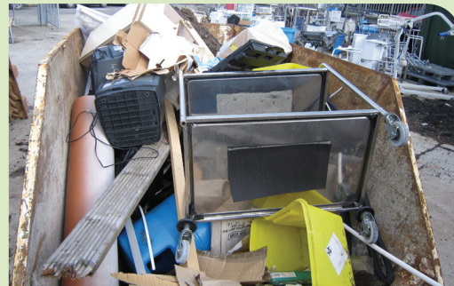
Example of a badly used skip containing WEEE and recyclables (cardboard, metal and plastic) - significant proportion can be recycled

Skips have been found to encourage the mismanagement of waste. Due to their size, recyclables can easily be thrown into the skip. Open skips allow rainwater to enter the skip, which is then absorbed by absorbent materials (e.g. cardboard). As skips are charged by weight, this can significantly increase your costs.