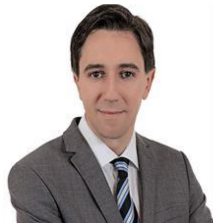
Minister Simon Harris

Simon is a native of County Wicklow and has been involved in the community all his life.