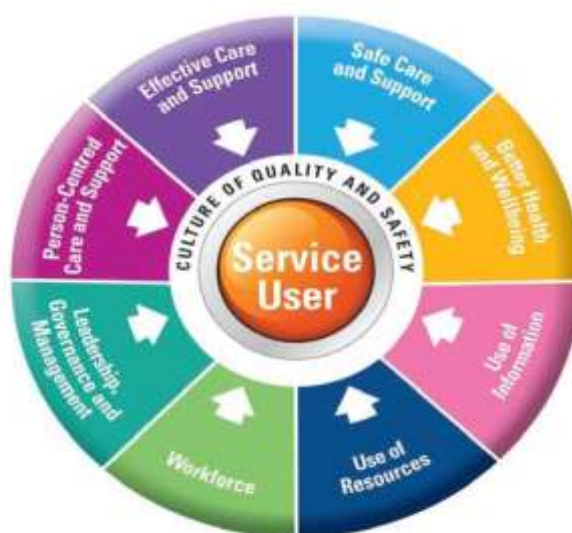
Figure 1: Themes for Quality and Safety

Decontamination practices in healthcare settings are aligned to all 8 themes, however, Theme 2 Effective Care and Support and Theme 3 Safe Care and Support are the key dimensions of quality and safety needed to support the delivery of safe decontamination services in healthcare settings.