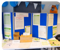
Royal Victoria Eye and Ear Hospital