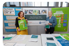
The Mater Hospital