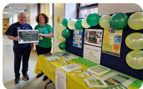
Cavan & Monaghan Hospital

Thank you for supporting this initiative to promote open, honest and compassionate conversations between staff and people who use our services.