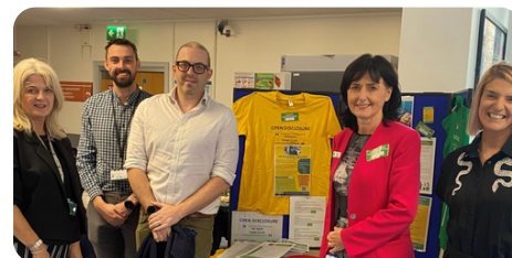
Tipperary University Hospital