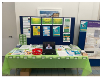
Sligo University Hospital