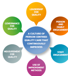
Figure 4: Framework for Improving Quality

Across the Irish healthcare system there is strong commitment to improving the quality of care. Improving quality is everybody’s business and to achieve real and sustained improvements we must find new and better ways to achieve the outcomes that we want. The Decontamination Safety Programme will use the 6 drivers for sustainable quality improvement to support implementation of best decontamination practice. These drivers include Governance for Quality, Leadership for Quality, Staff Engagement, Quality Improvement Methods and Measurement for Improvement