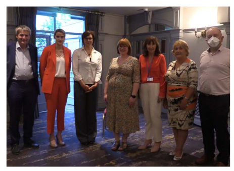
Panel speakers at the recent Tralee Dementia Friendly Brain Health Awareness