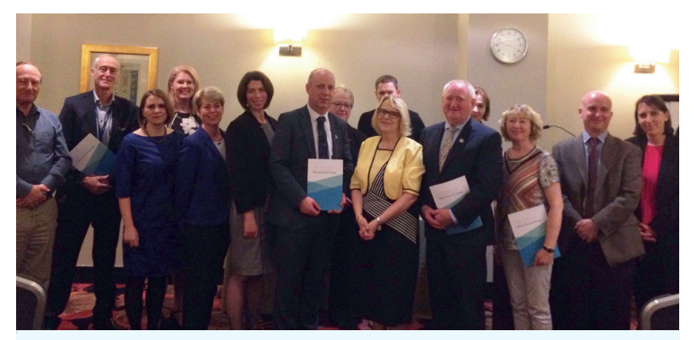
Jim Daly, TD, Minister of State, Mental Health and Older People launching the Mid-Term Review

The full report is available at health.gov.ie/wp-content/ uploads/2018/06/National-Dementia-Strategy-Mid-Term-Review-Final-English.pdf