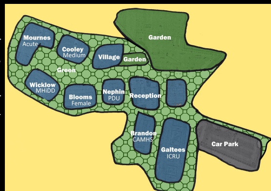
Portrane Naming Layout

Portrane has a National Heritage Area home to large colonies of winter migrating birds!