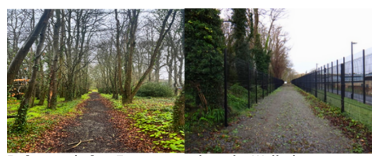
Before and after Entrance path to the Walled Garden

In the other quadrant we are developing a kitchen garden with polytunnels, beds and an orchard. Gardening and nature provide very important therapeutic benefits to our patients. This new large garden space will afford much more space than is currently available for gardening and other therapeutic activities into the future.