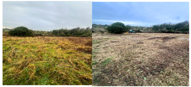
Before and after on quadrant one (Future recreational area/ wildflower meadow)