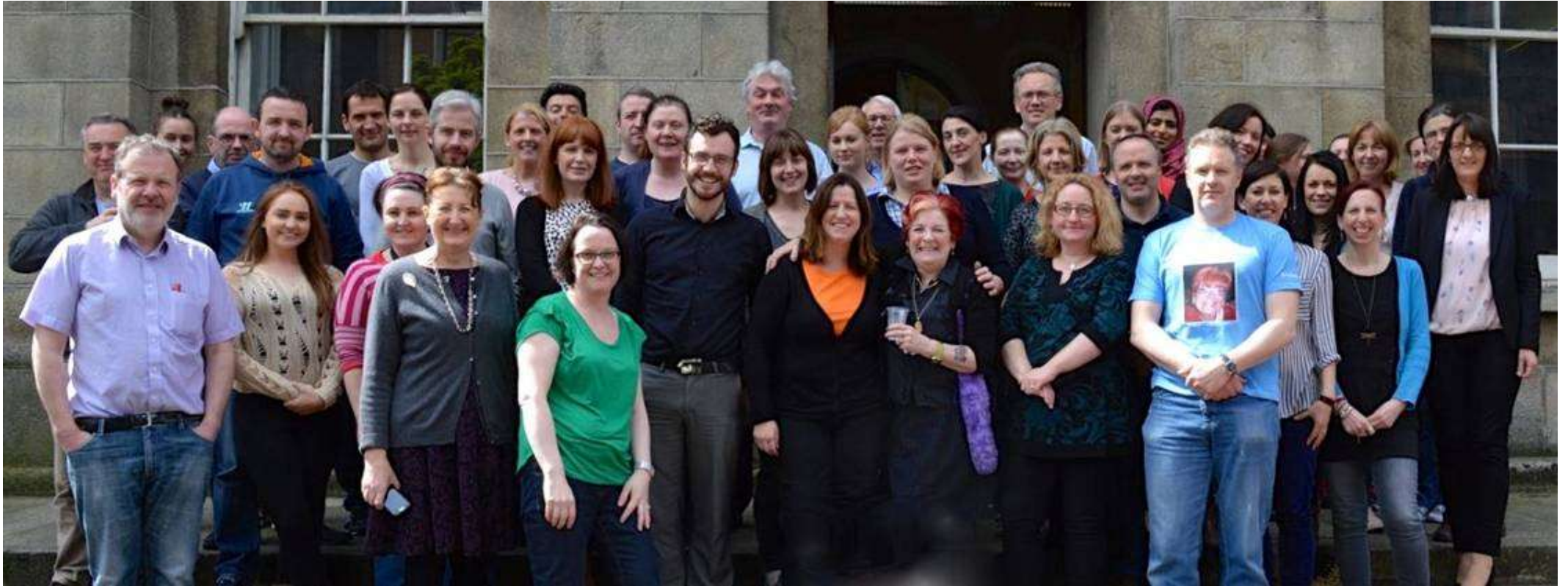
Most laboratory staff, on the occasion of a recent retirement.