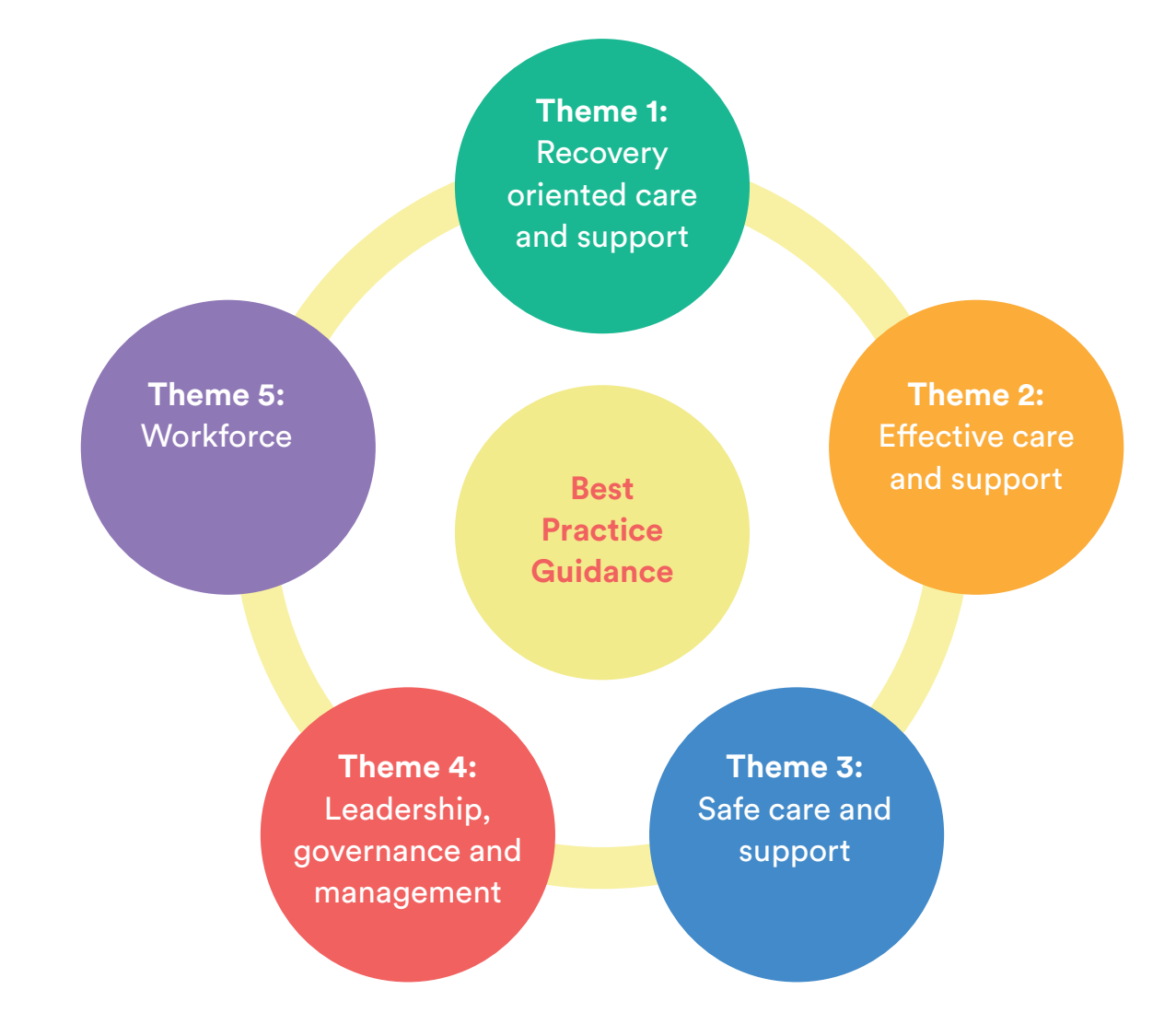
Chart 1: Structure of the Best Practice Guidance