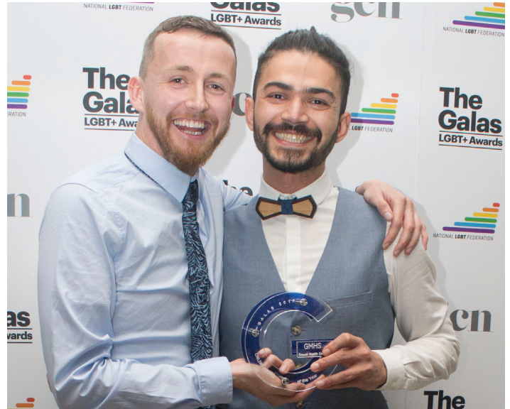
The National LGBT Federation GALA Awards honoured the Gay Men's Health Service with an award for Best Online Initiative