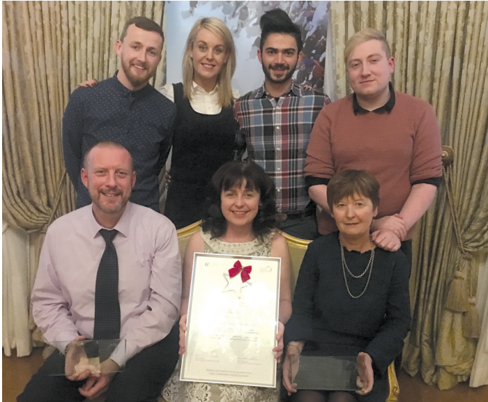
Innovation in Service Delivery Award* at the Health Service Excellence Awards 2017