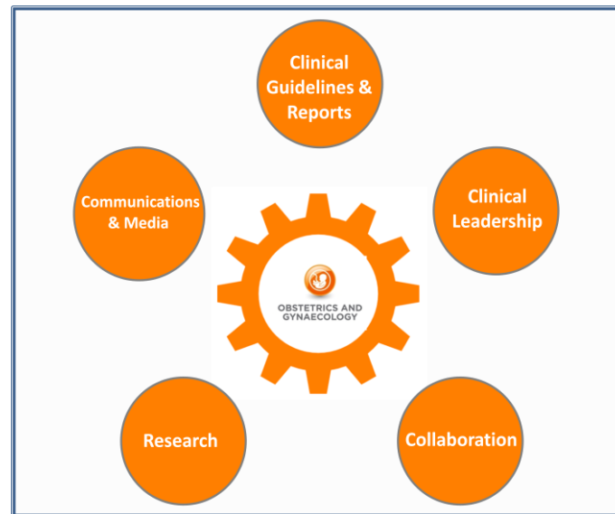
Figure 1. Programme Workstreams

For the purposes of this document, the work of the Programme has been categorised into the five workstreams described in Figure 1 below.