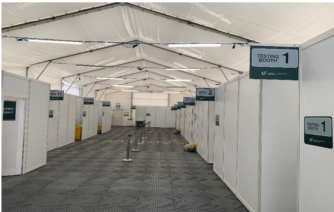
Testing Centre at City West Campus, Dublin

The experience of the services in managing the pandemic to date has required investment in a number of service continuity or additional capacity projects. These have focused mainly on the provision of semi-permanent testing and track and trace centres to manage the impact of the disease in the longer term, additional bed capacity and addressing other infrastructural deficits and capacity not included in the COVID 2 programme. This programme has been developed further in conjunction with the HSE as the Winter and Pandemic Plans were finalised and is now incorporated in to the 2021 Capital Plan.