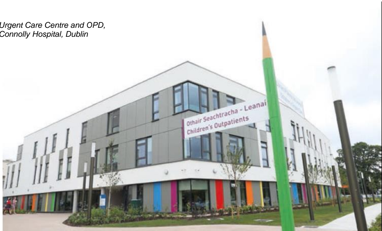
Urgent Care Centre and OPD, Connolly Hospital, Dublin