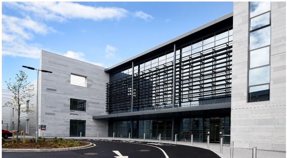
Oncology Facility, Cork University Hospital.

Projects to advance in 2021 include: Phase 2 Radiation Oncology Development Beaumont Hospital, an Aseptic Compounding Unit, CUH and TUH, relocation of the Oncology Day Unit, Letterkenny General Hospital and the Bone Marrow Unit at St. James' Hospital