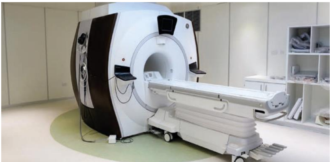
An MRI Unit

The level of funding for the national equipment replacement programme has been agreed for 2021 at €65m. Continuity of safe patient care is the primary objective of the HSE Equipment Replacement Programme, and Estates will continue to enable this.