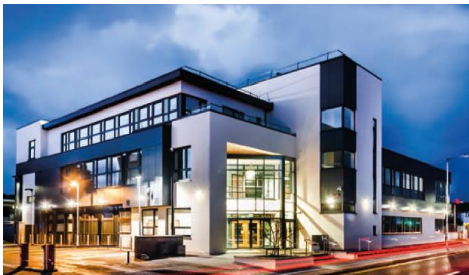
Claremorris Primary Care Centre Co. Mayo