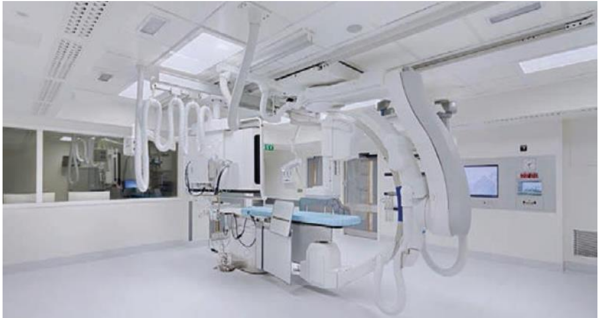
Cardiac Cath Laboratory