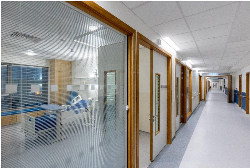
A new Ward Block

New Ward Block projects to advance in 2021 include: Beaumont Hospital, Cavan General Hospital, Galway University Hospital, Wexford General Hospital and Limerick University Hospital.