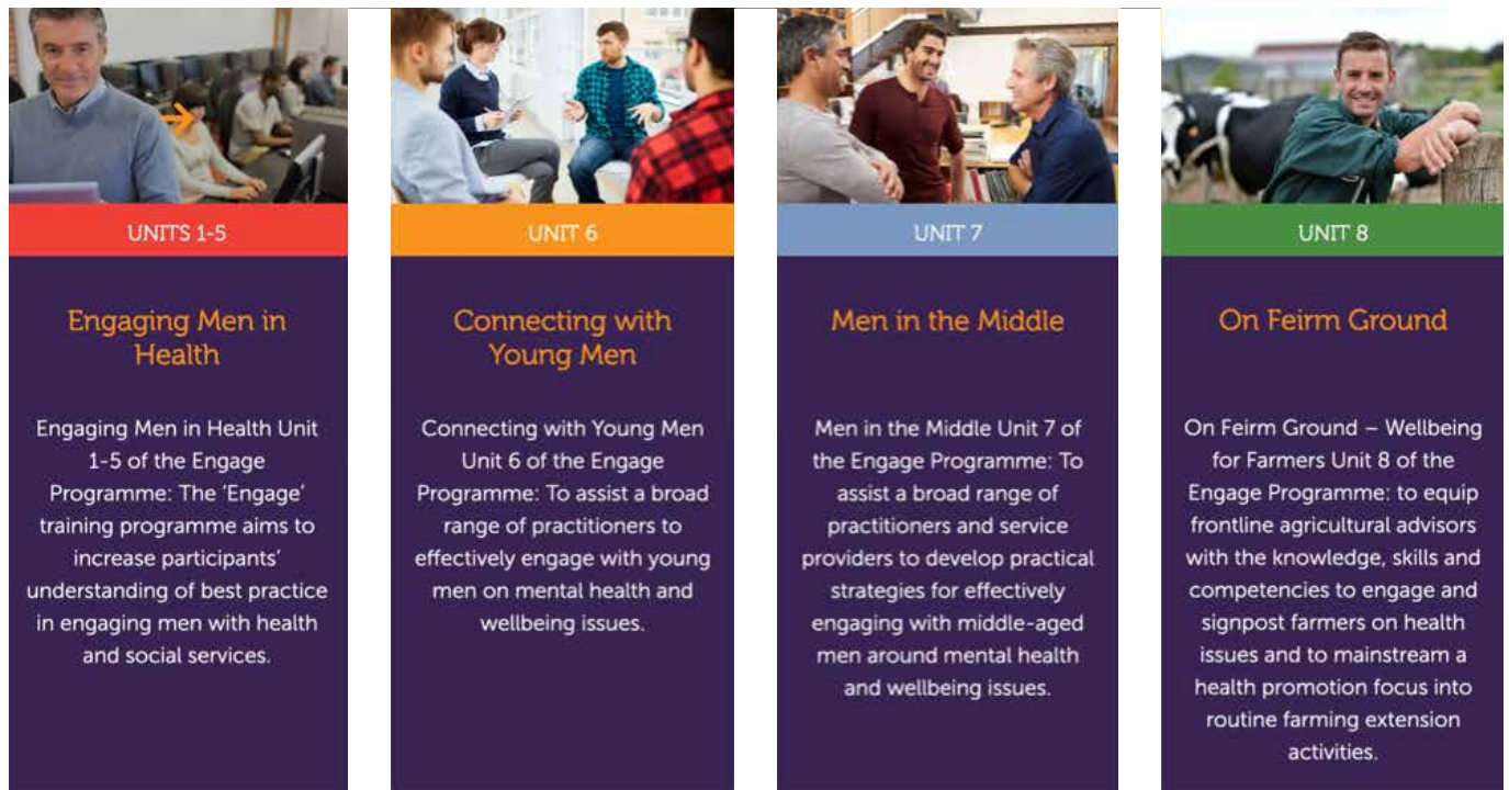
Figure 4: Overview of keys stages in the development of the ENGAGE men's health programme

The Policy has also provided leverage for policy change at a wider societal level. For example, the first National Men's Health Policy and Action Plan (NMHAP) called for the provision of statutory paternity leave, with pay, to new fathers. The introduction of the Paternity Leave and Benefit Act in 2016, and the Parents' Leave and Benefit Act in 2020, were significant steps forward in encouraging fathers to take a more active role in parenting and to provide greater support to their partners. Regrettably, however, in 2020, just over 50% of fathers in employment did not claim paternity benefit, up from 48.2% in 2019 - with significant variations across different industries, occupations, and socioeconomic backgrounds 36 . This highlights how deep-rooted societal and cultural norms and workplace expectations might have discouraged some men from taking extended time off for childcare responsibilities, and underlines the importance of maintaining a gender spotlight on men (and men's health). Although a recent report on fatherhood in Ireland reported a shift in patriarchal gender attitudes relating to care and roles of men and women in the home, men still lag significantly behind women on hours spent on care and housework 37 .