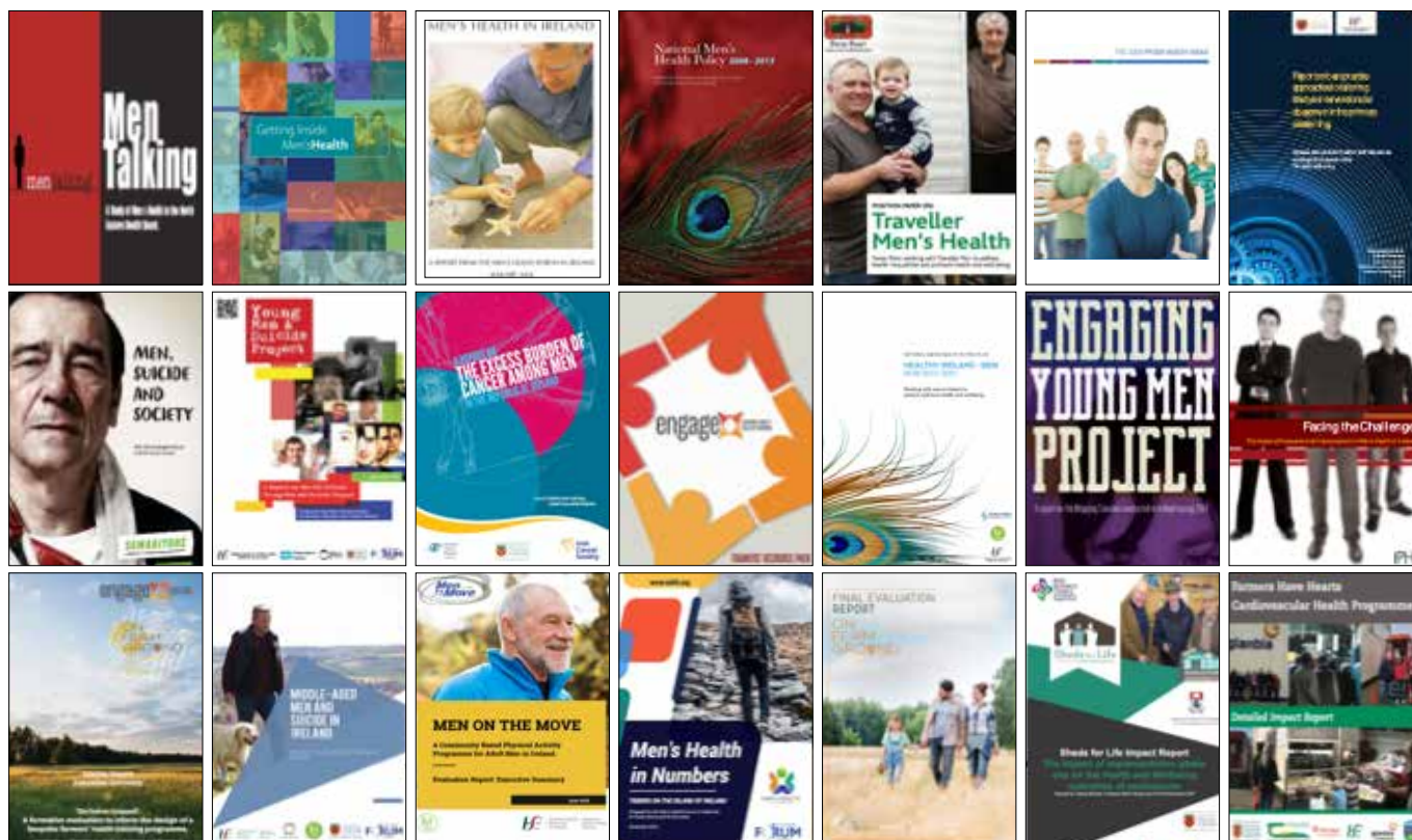
Figure 3: Partnership working underpinning men's health programmes

Capacity building has been a key pillar of policy implementation to date. Capacity building at individual, partnership and community levels is a critical component of both the process and outcome of positive engagement with men. Building capacity among front-line service providers through the Engage programme has been an integral part of building gender specific service provision for different target groups of men (see Figure 4). Recent developments have included the merging of Units 1-7 into one over-arching men's health programme ('Connecting with Men') and the expansion of 'On Firm Ground' to other agricultural professionals. The NMHP has also been instrumental in applying a gender lens to other policy areas, within and beyond the health sector. For example, the Department of Agriculture, Food and the Marine (DAFM) has recently funded an extensive programme of activities focused on farmers' mental health and wellbeing, informed by established NMHP principles and methodologies. These programmes reflect a much more holistic approach to the issue of farm health and safety, by accounting for the unique experiences and needs of farmers within the broader context of gender dynamics and farming masculinities.