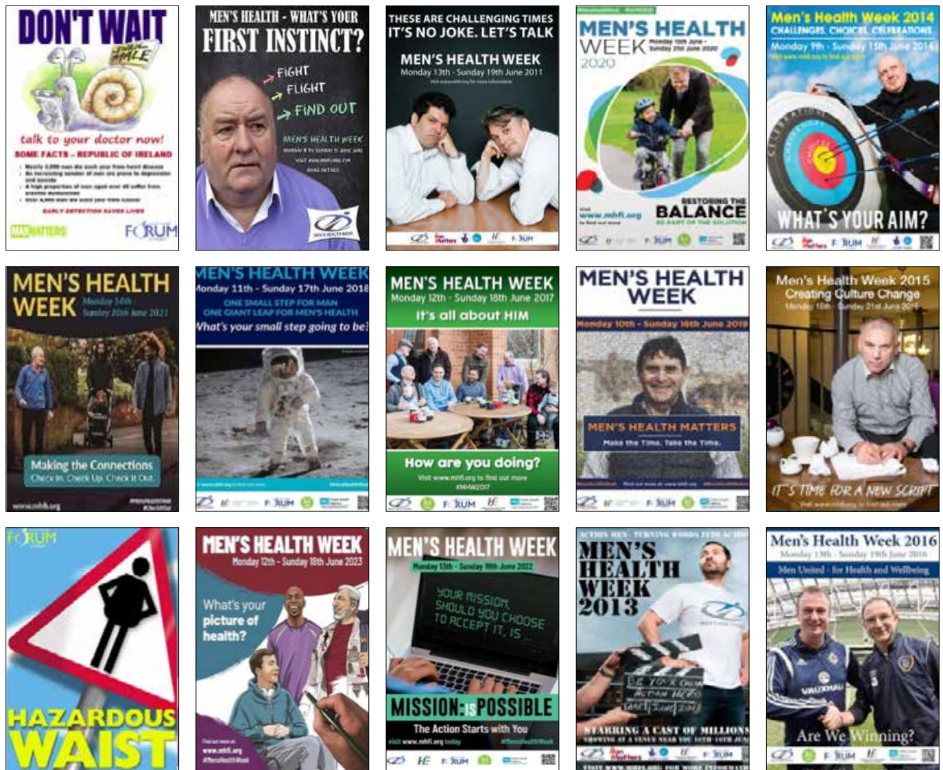
Figure 2: Themes from International Men's Health Week

The National Centre for Men's Health (NCMH), within South East Technological University (SETU; www.setu.ie ), has worked in partnership with wide-ranging stakeholders in conducting pioneering research on various aspects of men's health, informing evidence-based interventions, and shedding light on the unique health challenges that impact on men's health and wellbeing. This partnership approach to NMHP implementation has been instrumental in harnessing a collective effort and in optimising resources, training materials and toolkits to respond in a more targeted and culturally-appropriate way to the multifaceted needs of different population groups of men (see Figure 3 and Appendix 1).