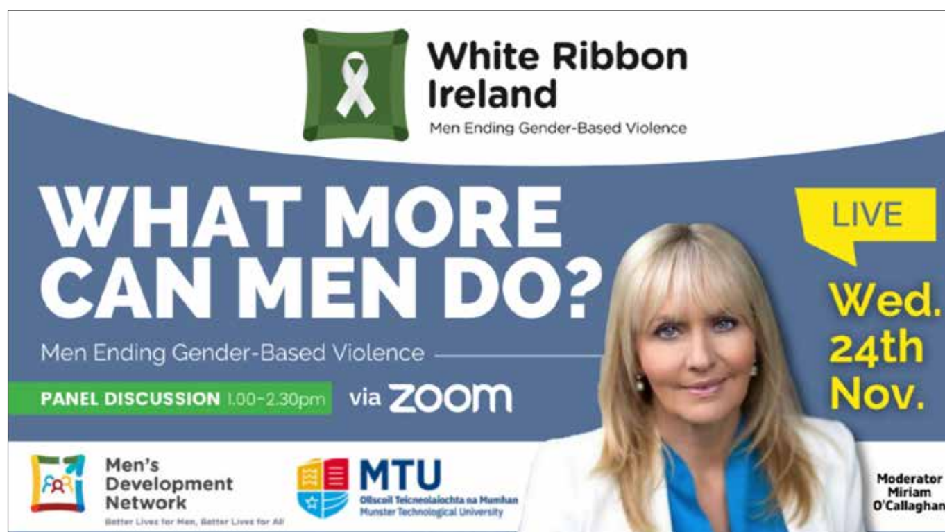
Figure 5: Men’s Development Network’s White Ribbon Campaign

in stopping violence against women and girls 38 . Whilst the issue of intimate partner violence (IPV) has been recognised as a gendered issue, disproportionately affecting women 39 , it is important to also account for how men conceptualise and experience IPV 40 . There is scope for HI-M 2024-2028 to support the implementation of the recent publication of the Domestic, Sexual and Gender-Based Violence strategy 41 in striving for the promotion of healthy masculinities and a zero tolerance approach to gender-based violence. Healthy masculinities ‘are characterised by equality and respect, non-violence, reflection and self-awareness, emotional expression and vulnerability, and accountability.’ 42p6 Boys’ and men’s experiences in connection with others and in community is central to the context in which healthy masculinities develop. By facilitating experiences of growth-fostering relationships of empathy, mutuality, and empowerment, this can promote human capacities for vulnerability, connection, and compassion into healthy and flexible ways of being men in the world. These relational experiences are critical to prevention, health promotion, and social change efforts at the social, community, and systems levels 43 .