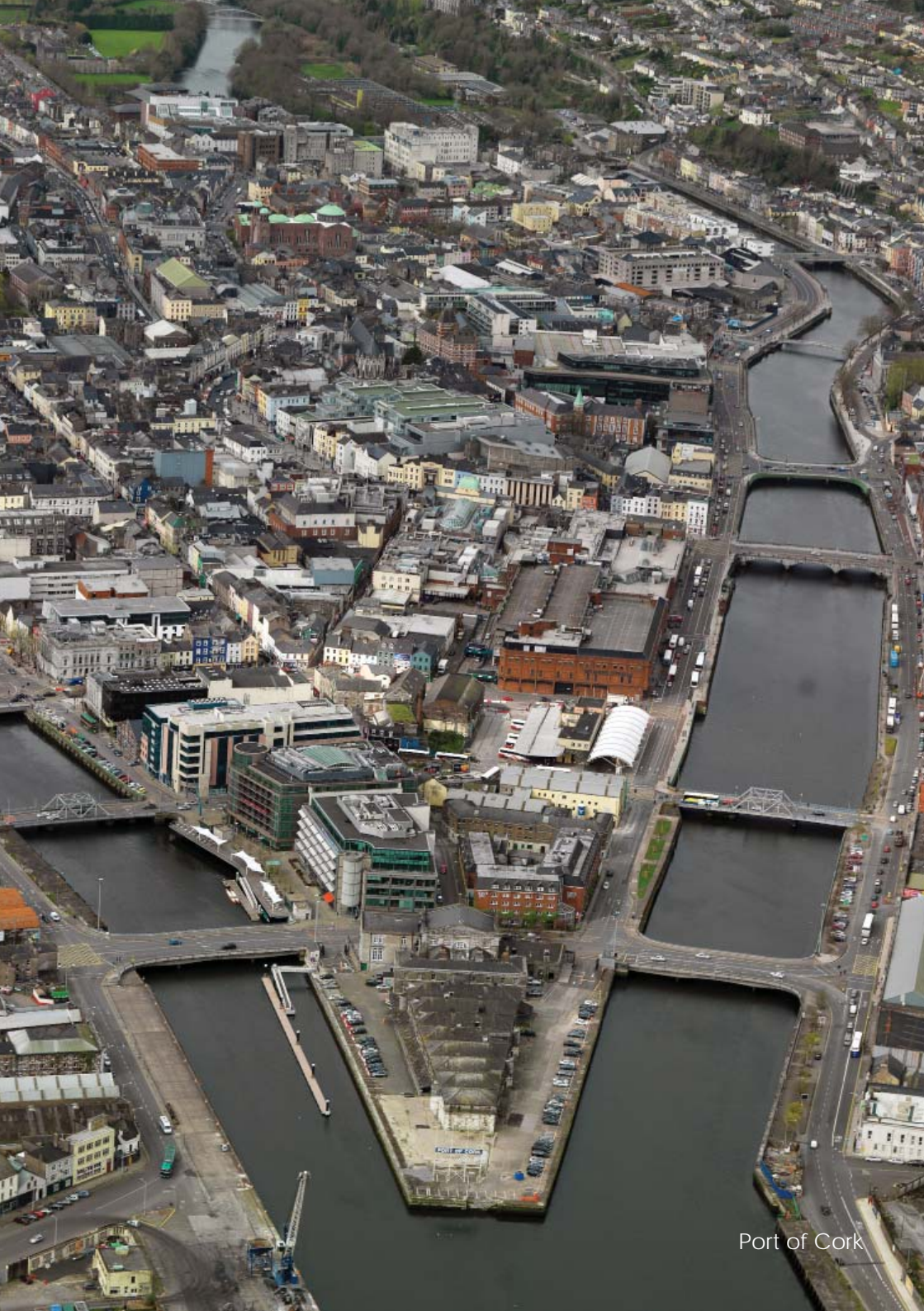
Port of Cork