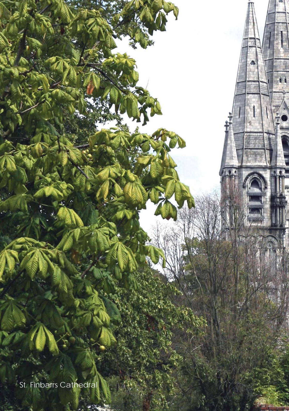
St. Finbarrs Cathedral