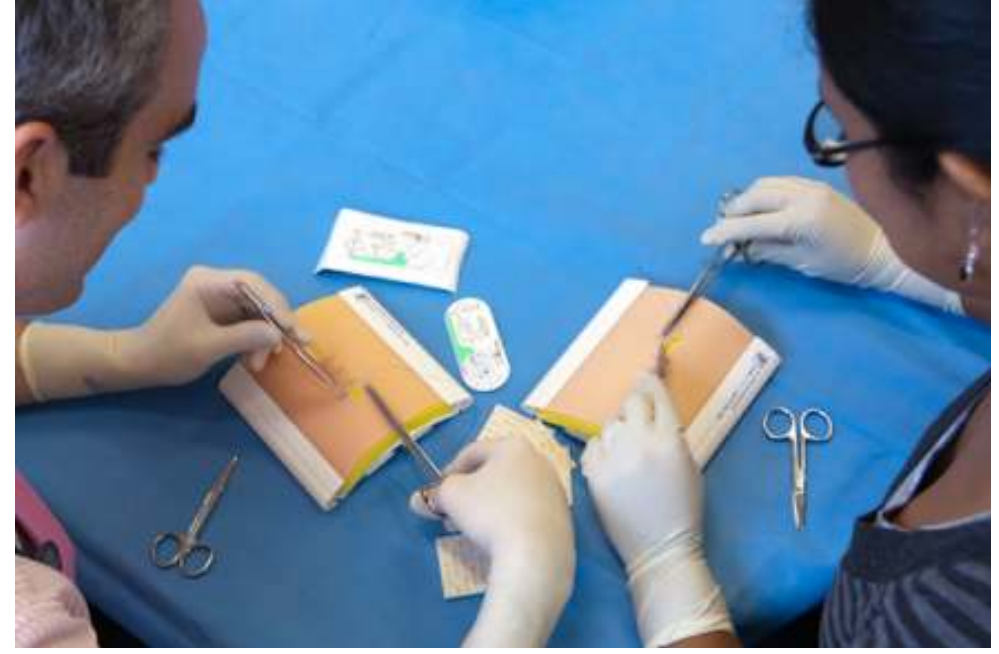
NUIG Interns 2011/12 in Clinical Skills Training

Intern training posts will commence on July 11th 2016. Internship training must comprise a minimum of 12 months, during which interns must complete a minimum of three months in each of medicine in general and surgery in general and may complete two to four months in other specialties which have been recognised by the Medical Council for intern training. Details of posts available in July 2016 will be provided to applicants who are deemed eligible after Stage 1 of the application process.