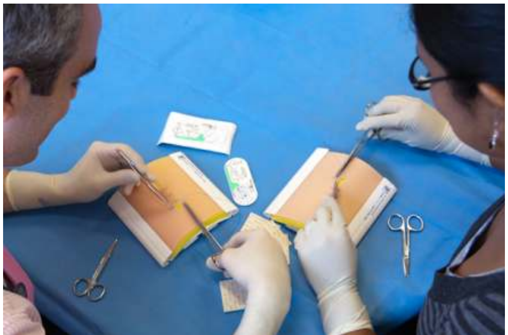
NUIG Interns 2011/12 in Clinical Skills Training

Intern training posts will commence on July 14th 2014. Internship training must comprise a minimum of 12 months, during which interns must complete a minimum of three months in each of medicine in general and surgery in general and may complete two to four months in other specialties which have been recognised by the Medical Council for intern training. Details of posts available in July 2014 will be provided to applicants who are deemed eligible after Stage 1 of the application process.