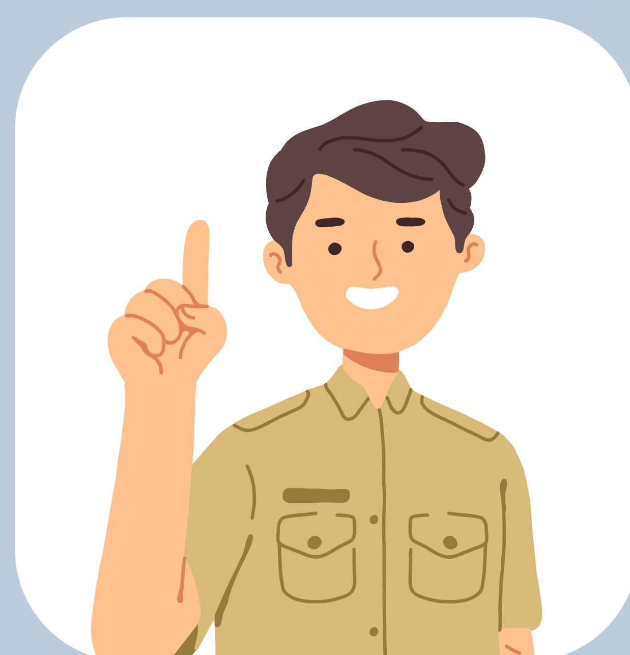
The Public Appointment service