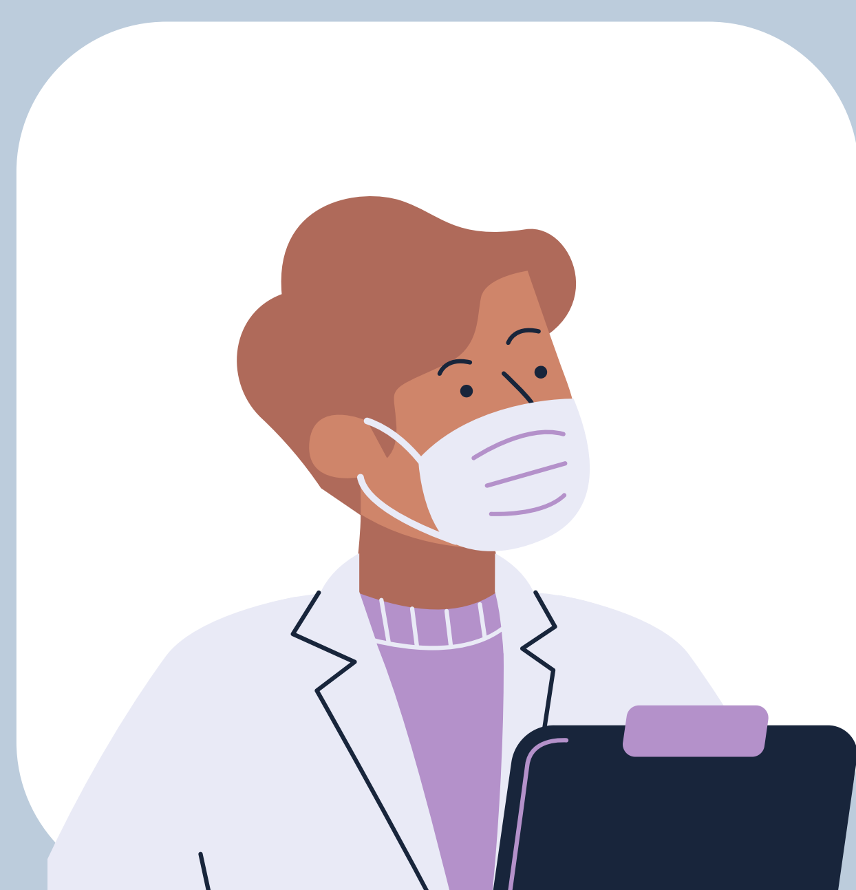
Health Business Services

Speakers will include representatives from: