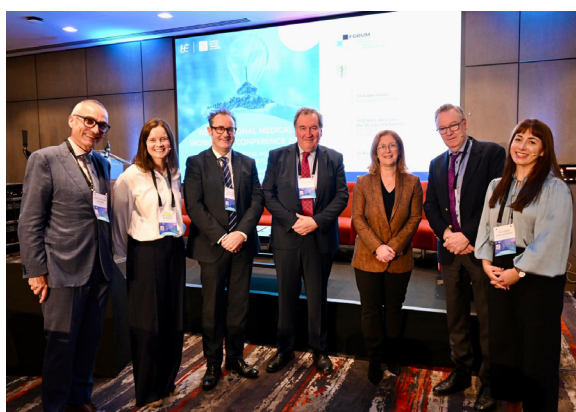
Some of the speakers and panellists at National Medical Workforce Conference