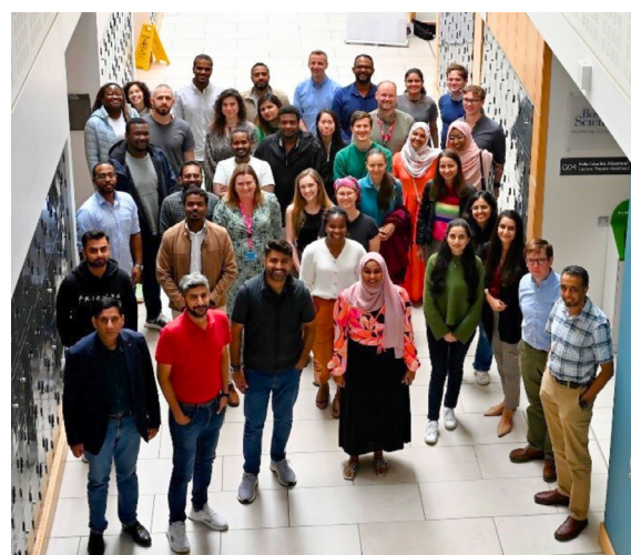
Participants at ASSERT Centre, UCC

The EMeraldSIM sessions were held at University College Cork and five other hospitals in South/Southwest in July 2024. A total of 65 International Medical Graduates (IMGs) participated. The programme received excellent feedback, with participants rating it 98/100 for overall quality and 99/100 for likelihood to recommend it to a colleague.