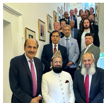
College of Physicians and Surgeons Pakistan delegation

The HSE and the Irish Postgraduate Medical Training Bodies hosted a delegation from CPSP in September 2024 and held the HSE/CPSP IMG Scholarship Programme Steering meeting during their visit. This was in addition to many online meetings with representatives from SMSB to ensure that their trainees were assisted as much as possible with their travel arrangements which were impacted by the crisis in Sudan.