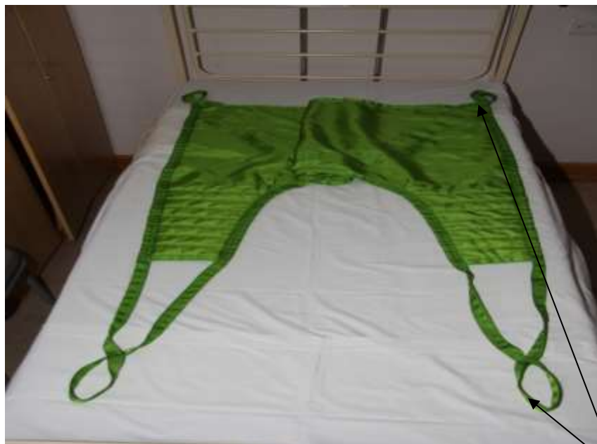
Fig.1 – Sling with loop attachments

Please note different slings have different mechanisms to attach to the hoist (e.g. single loop, multi-loop, clips) therefore the operator(s) must ensure they follow the specific manufacturer's instruction and relevant training received when attaching the sling to the hoist currently in use at their work location.